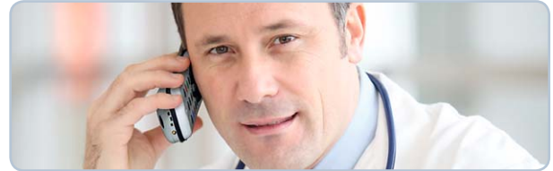
Doctors' practises, hospitals and clinics