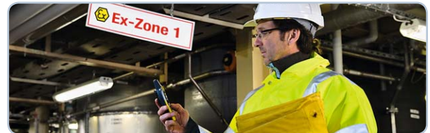
ATEX industrial environments