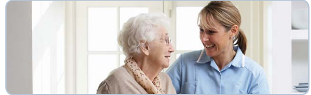
Retirement and nursing services

f.airnet DECT over IP: a single solution for any application scenario