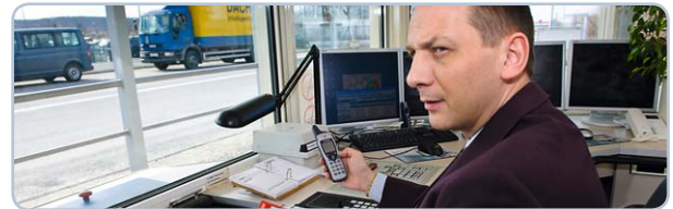
Industry and plant security